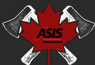
Photo sponsor of the event

Customized green screen backdrop with your company logo